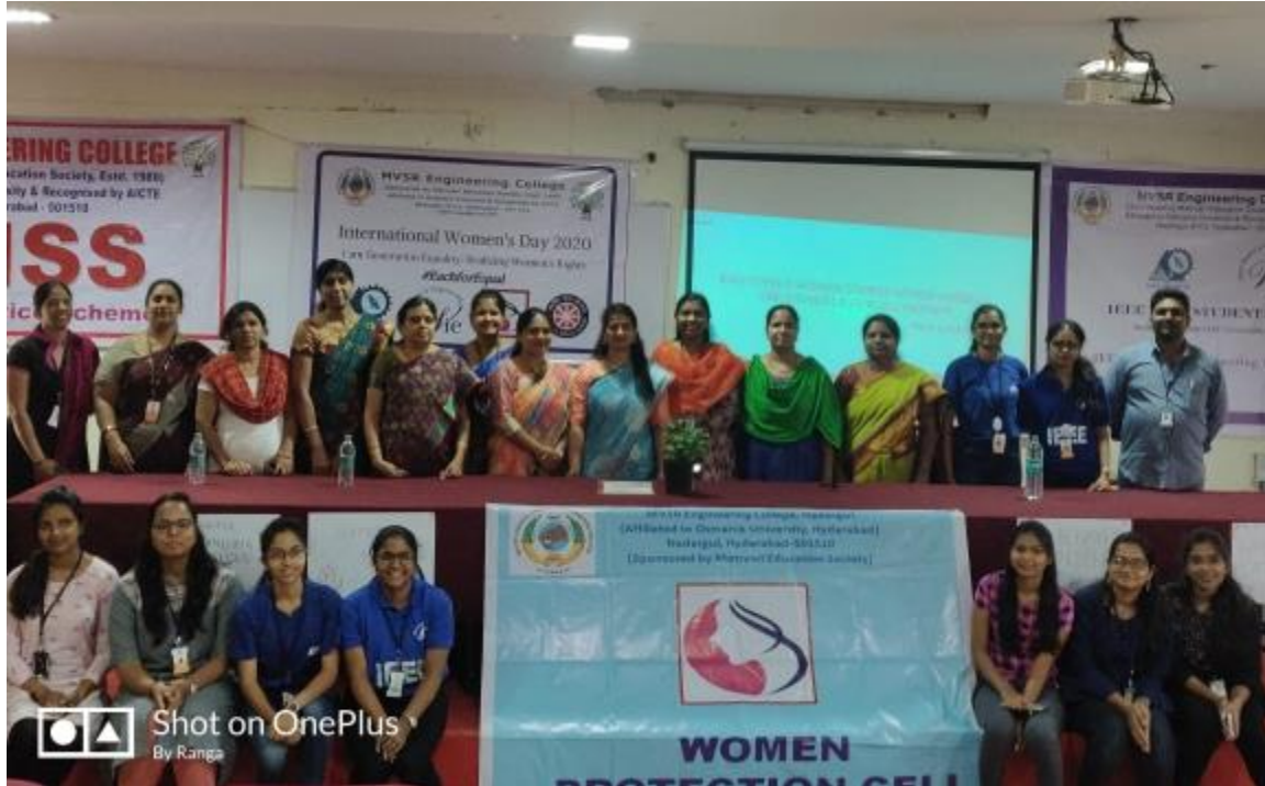
Group picture with the speaker

The team volunteers organized and implemented various event and students performed cultural programs like singing, dancing, etc., depicting the importance of women empowerment and girl child education in the civilized times.