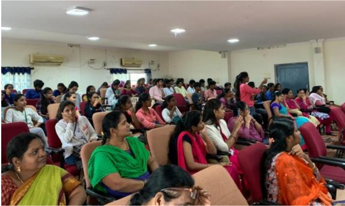
Active student participation from both boys and girls in the event.